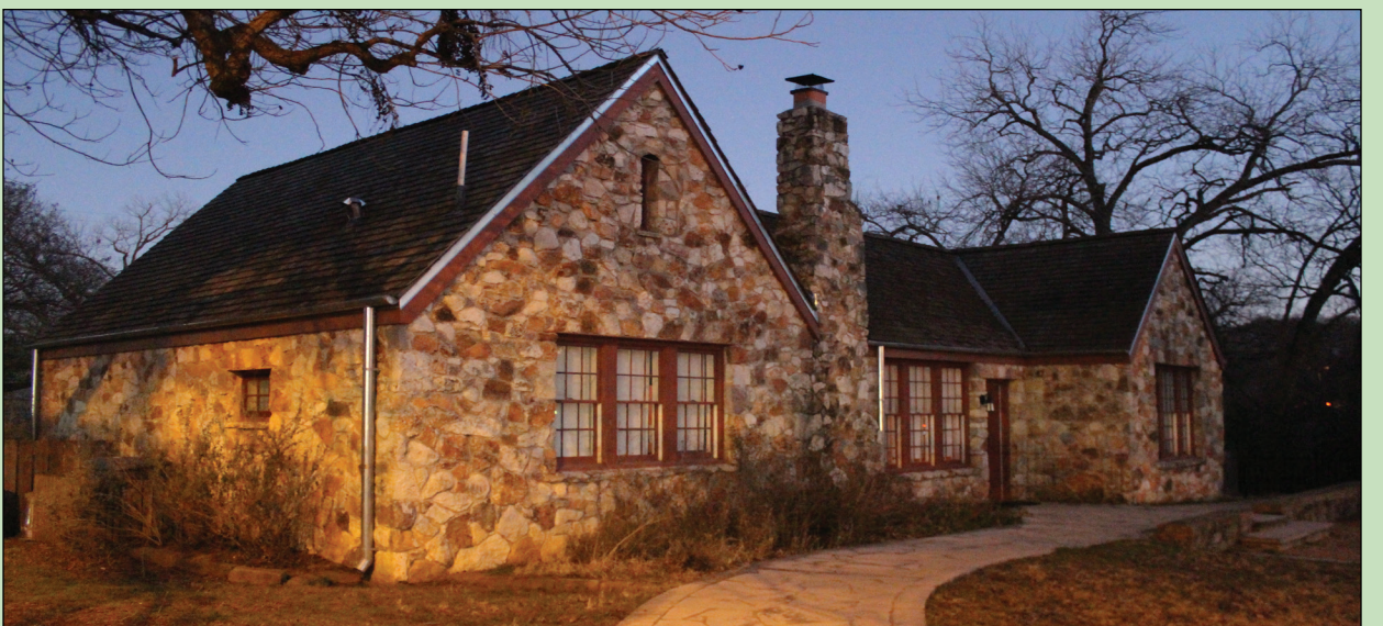
PARK'S HOME Zilker Caretaker's Cottage remains one of the oldest standing structures from the beautification that occurred in the '30s. The cottage now serves as Park Rangers headquarters.