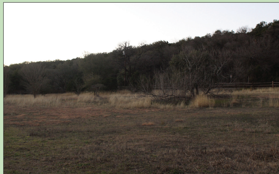
FIELD DAY Near the Greenbelt field, empty grasslands can be used for activities such as picnics.