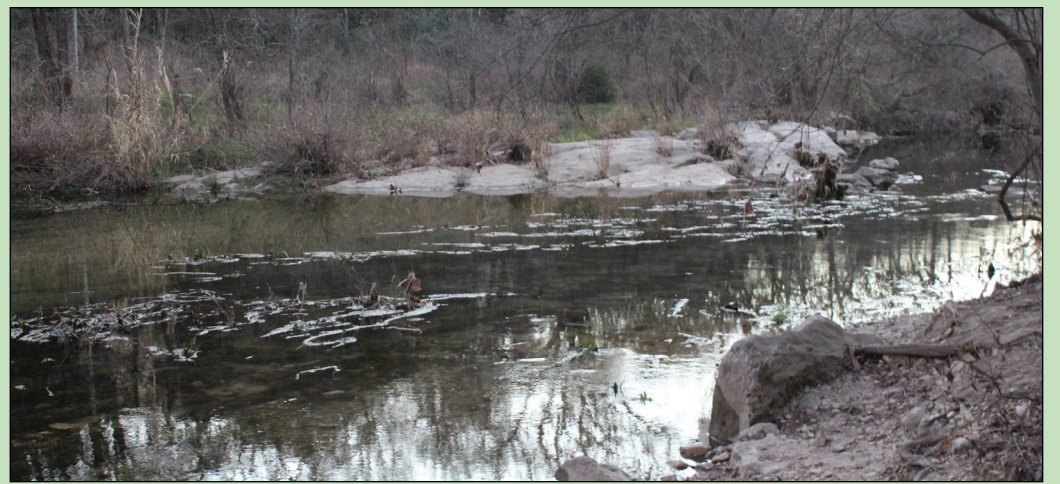
TAKE A STROLL Barton Spring's creek is by the Greenbelt Trail, serving as another alternative to the pool.

Zilker Park is referred to as the "Jewel in the heart of Austin," by Visit Austin. The park was founded in 1917, and has been claimed to be Austin's most-loved park, according to Austin Parks and Wildlife. Zilker has many recreational opportunities, including a botanical garden and the Barton Spring pool, drawing people to the park and making it one of the best places to spend time, also according to Visit Austin. It has held major annual events such as Austin City Limits and the Trail of Lights.