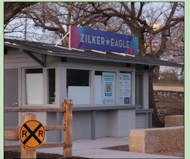
ALL ABOARD The Zilker Eagle mini train has made its rounds since 1961, pausing in 2019, but its expected to start again in 2022. The train is one of many features of Zilker Park, a major center for events and activities in the Austin area.