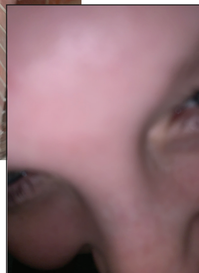
BREATHTAKING BEAUTY Art Picasso's modern photographs break boundaries in art and expand what we thought was possible. The show will be open to the public next month.