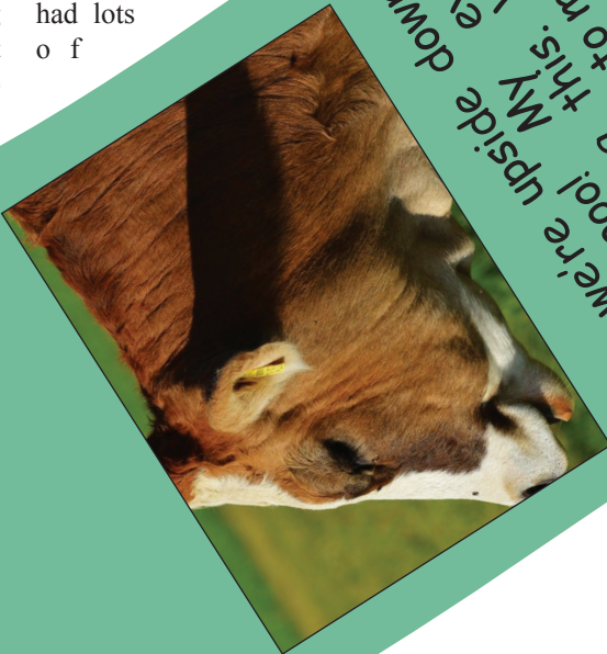
GWAPHIC HEWE PWEEZE

we're doing pictures this way now hope that's ok pookie. I know reading is super duper hard.